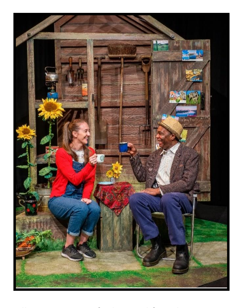
They learn it is really important to find a good friend.